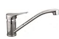
Bealey 40.9196.CH Pg. 90