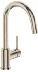
Brushed Nickel 40.0813.BN