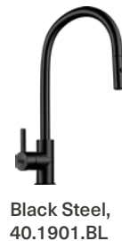
Black Steel, 40.1901.BL