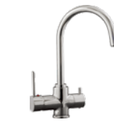
Otto Gooseneck with Water Filter 40.9198.CH Pg. 110