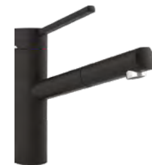
Matt Black, 40.1880.BL