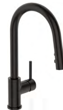
Uno Gooseneck, Pull-out Spout, Black