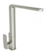
Brushed Nickel, 40.0822.BN