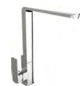
Ion Kitchen Mixer 40.0820.CH Pg. 96