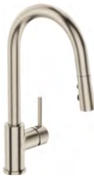
Brushed Nickel 40.0816.BN