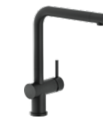
Active Plus Swivel 40.1881.BL Pg. 94