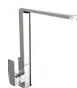
Percy 40.9299.CH Pg. 98