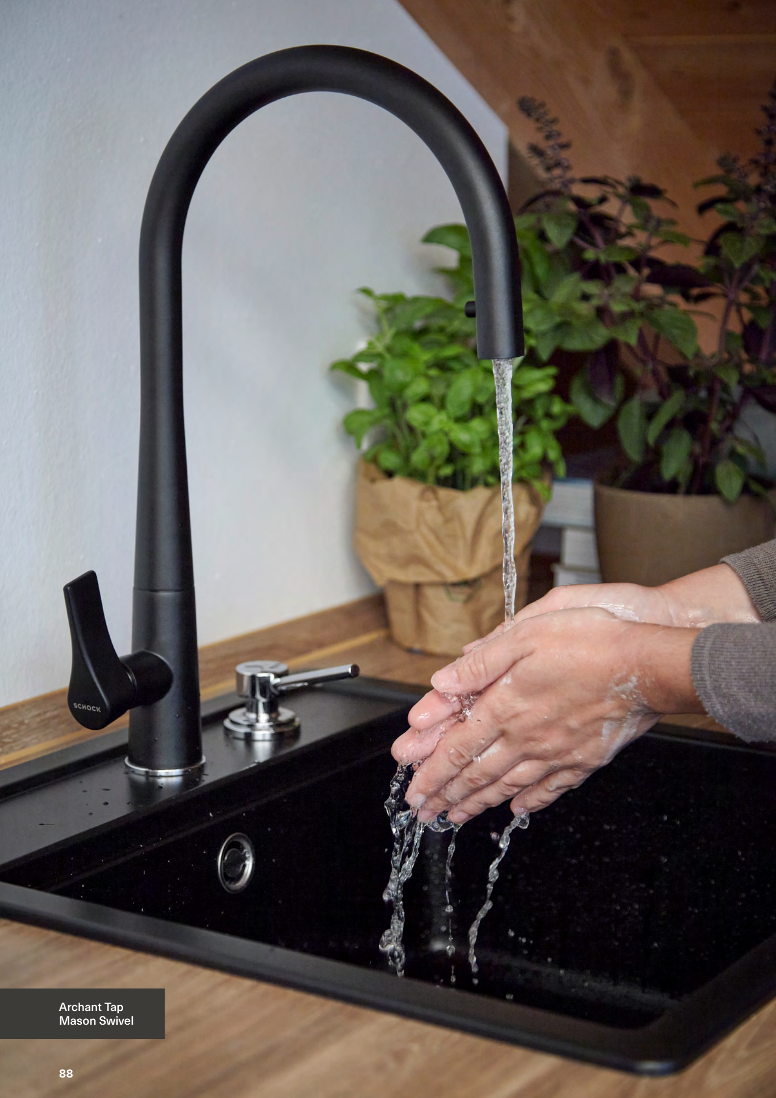
Archant Tap Mason Swivel