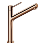
Madrid 40.9240.CO Pg. 92