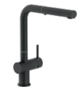
Active Plus Pull-out 40.1882.BL Pg. 94