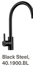
Black Steel, 40.1900.BL