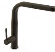
Sinos Pull-out 40.1884.BL Pg. 94