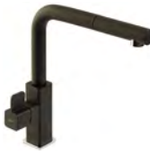
Mythos Pull-out 40.1885.BL Pg. 96