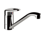
Swing Swivel 40.1861.CH Pg. 90