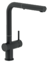
Matt Black, 40.1882.BL