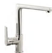
Okura 40.9204.CH Pg. 98