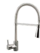
Opal 40.9199.CH Pg.112